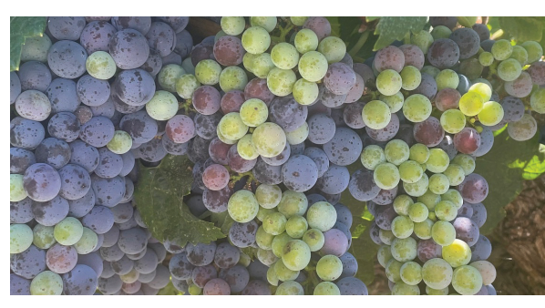
Veraison, "the changing of color in grapes"